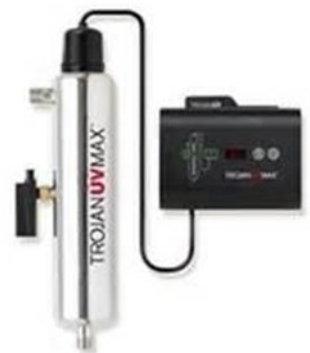
TrojanUVMax IHS12-D4 Installation